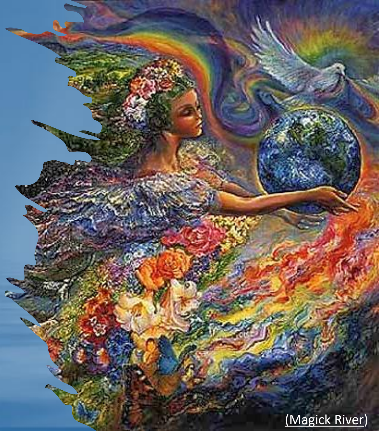
( Magick River )