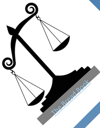
The Bread Book