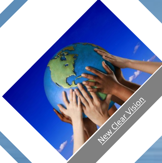
New Clear Vision