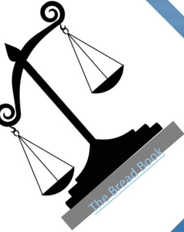
The Bread Book