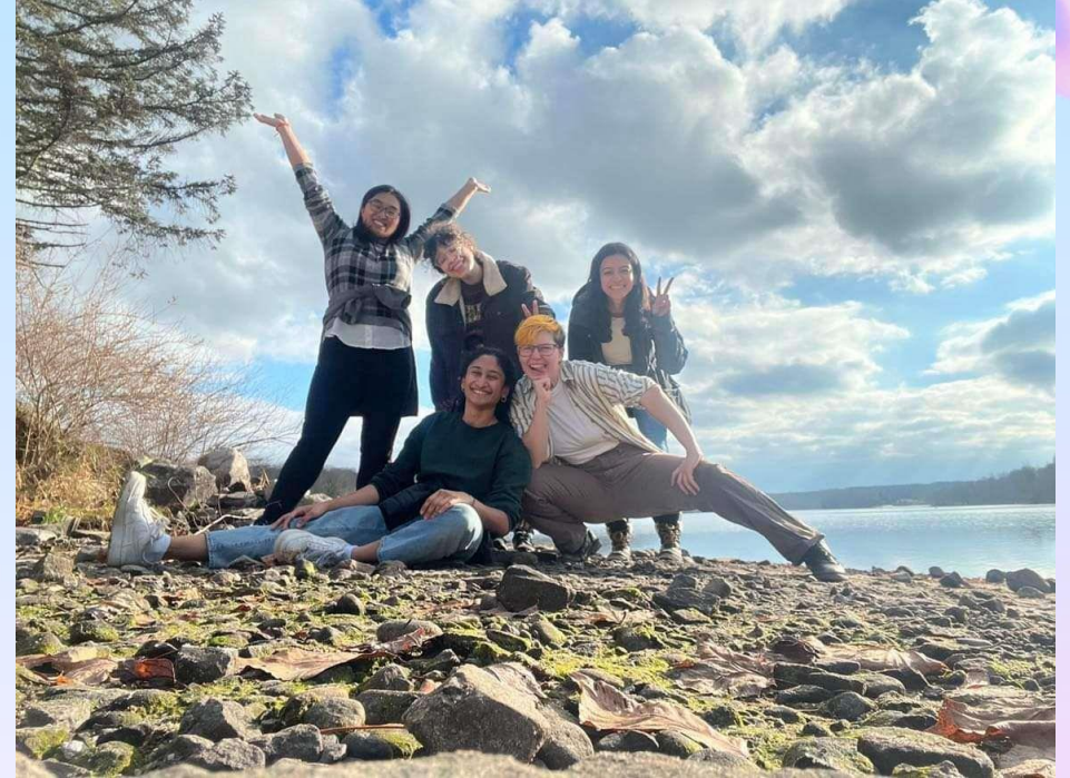
Writing retreat in the Pocono Mountains