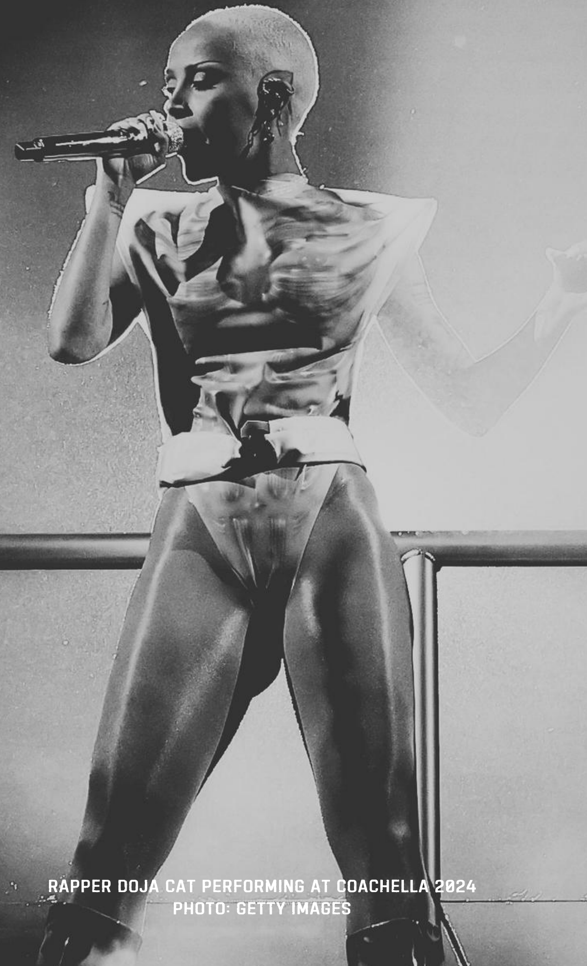
RAPPER DOJA CAT PERFORMING AT COACHELLA 2024