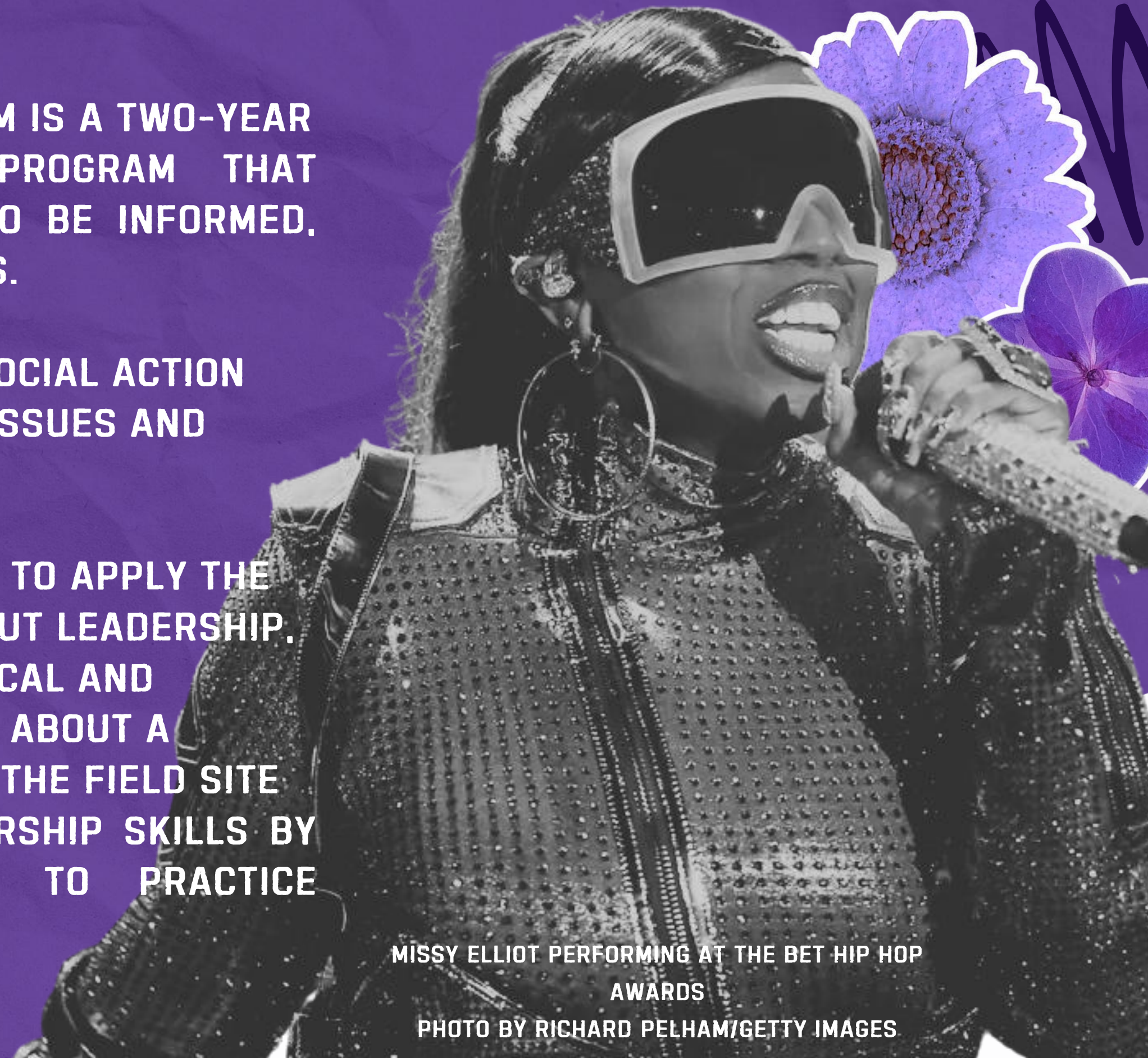
MISSY ELLIOT PERFORMING AT THE BET HIP HOP AWARDS

RUTGERS-NEW BRUNSWICK Institute for Women's Leadership