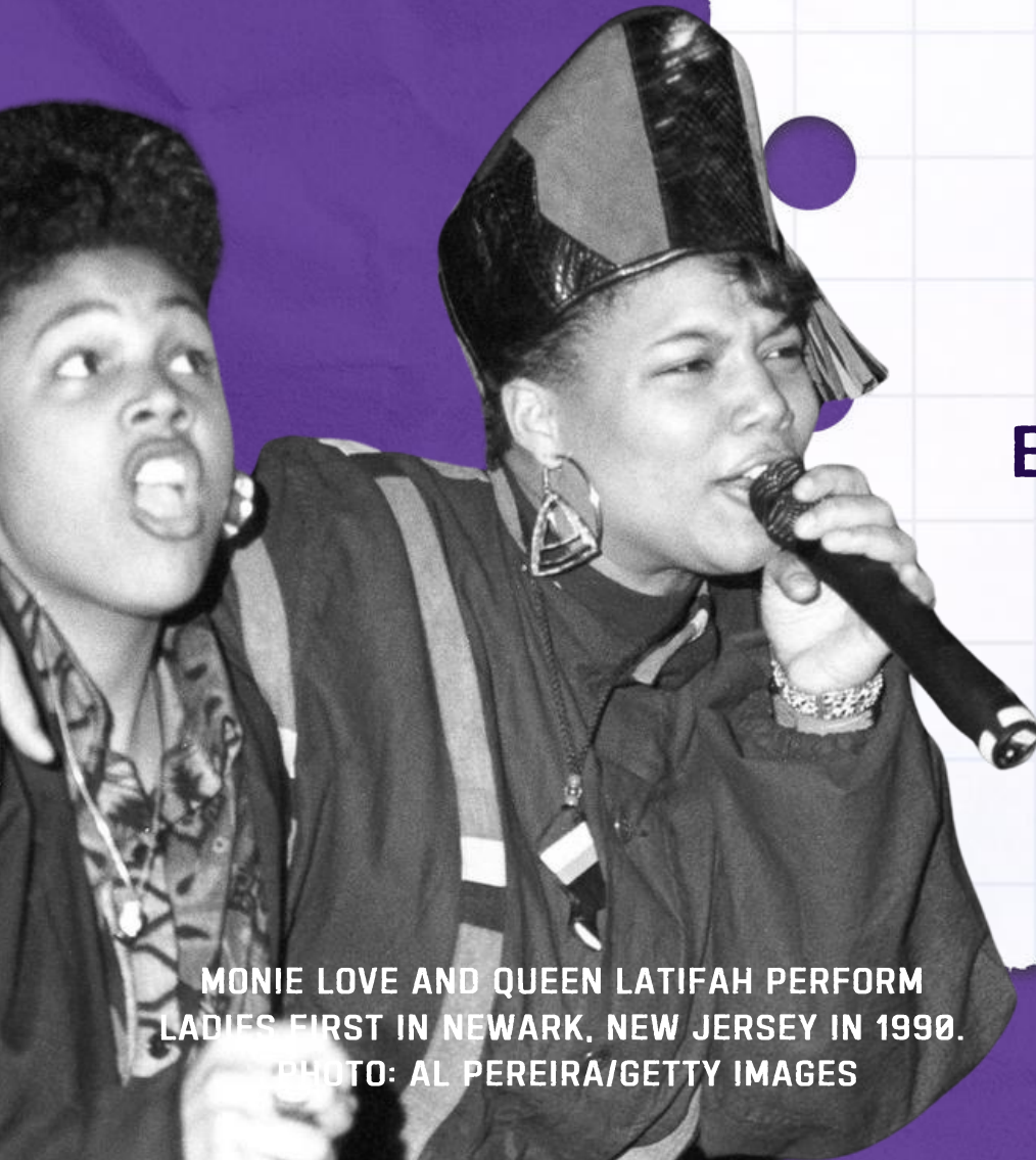
MONIE LOVE AND QUEEN LATIFAH PERFORM LADIES FIRST IN NEWARK, NEW JERSEY IN 1990.

BLACK FEMINIST LENSES SUCH AS HIP HOP FEMINISM, HOOD FEMINISM AND TRAP FEMINISM ARE OFTEN DEEMED ILLEGITIMATE WHEN DEPLOYED BY BLACK WOMEN